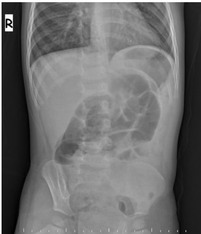
Figure 1. Abdominal radiograph shows air-fluid levels in projection of small bowel loops.

A 2-year-old Caucasian male presented to our pediatric department with fever, vomiting, and diarrhea. The clinical examination revealed a mild depletion of body fluids and absence of abdominal pain. Laboratory tests were normal. The patient was admitted to the pediatric unit and fluid infusion for gastroenteritis was administered. The following day colicky episodic abdominal pain and bilious vomiting started. The clinic examination revealed abdominal pain with guarding and rebound tenderness on the right side. Rectal examination showed right-sided tenderness with negative stool. An abdominal radiograph revealed air-fluid levels in the projection of the small bowel loops (Figure 1). Abdominal ultrasound examination showed di-